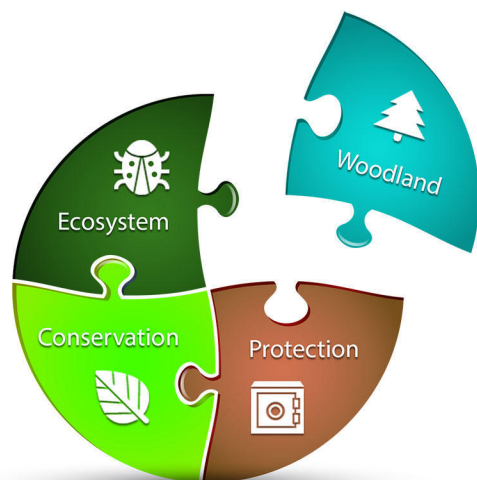
Forest & Ecosystem Restoration

People choose consecrated woodland burial because it provides the greatest protection available under English Law. Additional assurance comes from the knowledge that everything is also protected by the oversight of the church. It's the closest you can get to a guarantee that you will rest in peace.