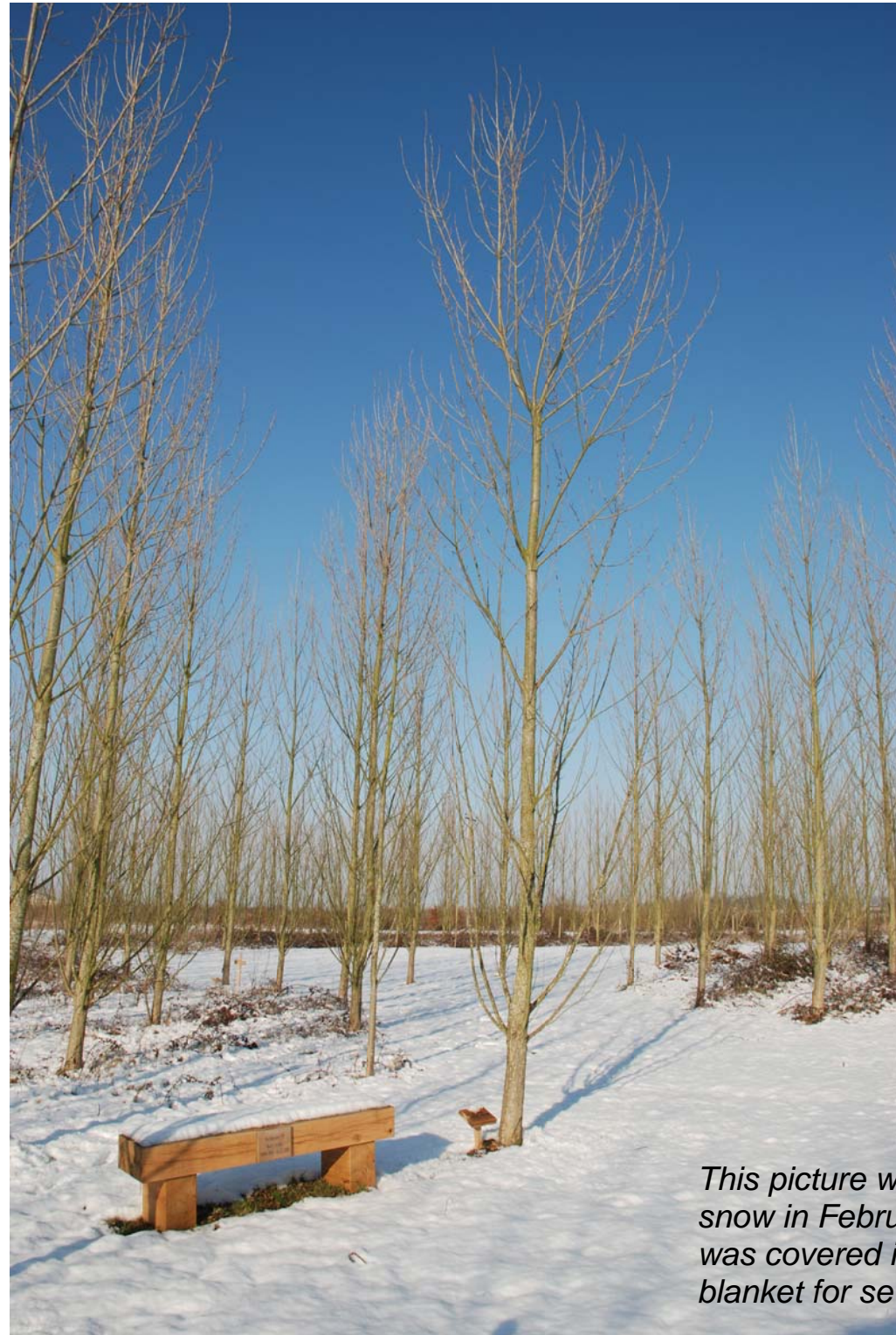
This picture was taken during the snow in February. The woodland was covered in a beautiful white blanket for several days.