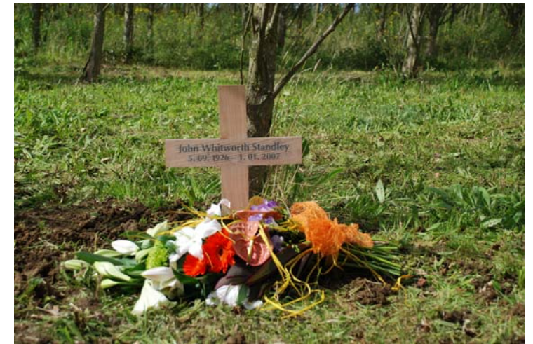
This ashes plot is one of many which have been chosen this year by families seeking a place for interment.

We have seen a considerable growth in interest in woodland burial across the media in the past year and we have noticed a corresponding increase in the number of people who have decided to be buried in the woodland. We have taken many reservations and quite a number of interments of ashes following cremation.