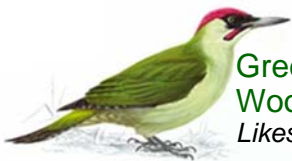
Green Woodpecker Likes open glades